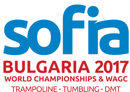
FIG TRAMPOLINE GYMNASTICS WORLD CHAMPIONSHIPS & WAGC