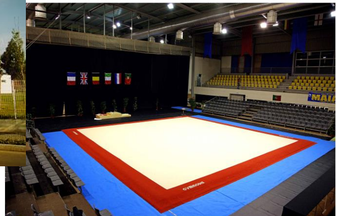
MIAC 2011 © Acro Clube da Maia