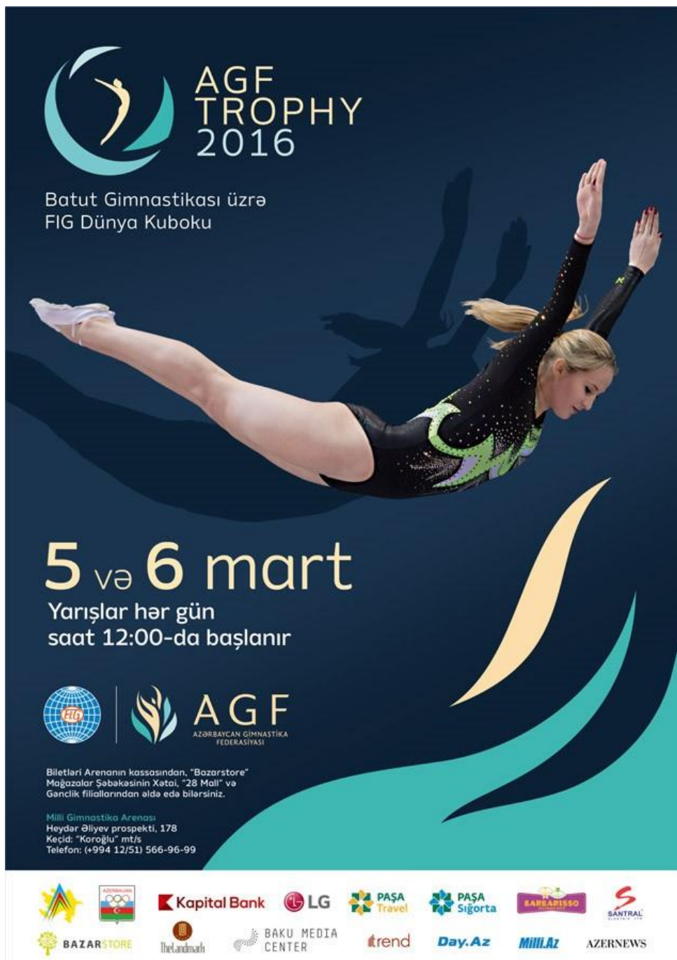
FIG WORLD CUP IN TRAMPOLINE GYMNASTICS AGF TROPHY