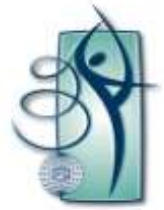
FIG RHYTHMIC GYMNASTICS „DUNDEE“ WORLD CUP SOFIA, (BUL) 09 – 10 AUGUST 2014 INDIVIDUALS AND GROUPS B CATEGORY