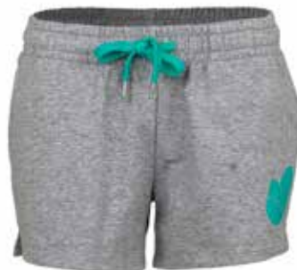
Short mint 200 NOK