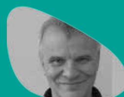
Eirik Hagen Logistics