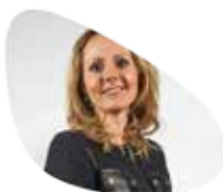
Linda Hofstad Helleland Minister of Culture