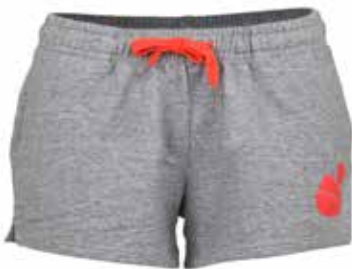
Shorts coral 200 NOK