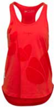
Tanktop coral 155 NOK