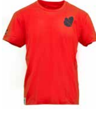
Tshirt coral 155 NOK