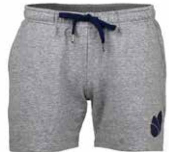
Shorts navy 200 NOK