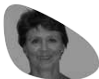
Norwegian Gymnastics Federation

On behalf of the Organising Committee I would like to extend a warm welcome to all delegations and wish everyone an excellent stay in Vestfold!