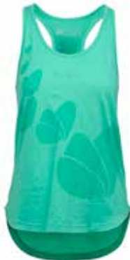
Tanktop mint 155 NOK