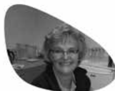
Gymnastics for All Committee

The slogan for the event is "Rhythm of the waves" and that, together with the royal touch with the King of Norway attending, makes it very special. We are both happy and proud and we thank the Norwegian Gymnastics Federation for making this come true.