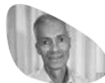
Local Organising Committee