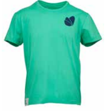
Tshirt mint 155 NOK