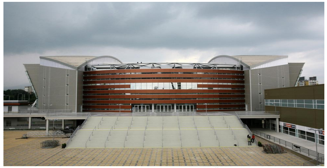
Arena Armeec Sports Hal