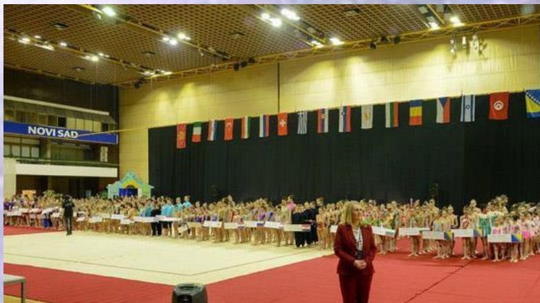
Trophy of Novi Sad 2018 – 620 participants, 17 countries 54 clubs