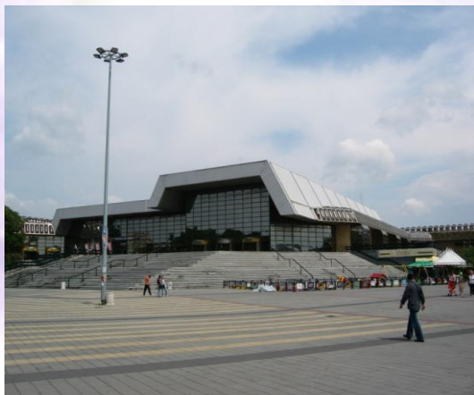
Sport center Vojvodina Competition hall – 2800 m 2 High 16 m, 3 warming up carpets

Official photographer, live stream and online results will be available.