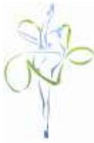
FIG RHYTHMIC GYMNASTICS WORLD CUP TASHKENT (UZB) 22 – 24 MAY 2014 INDIVIDUALS AND GROUPS B CATEGORY