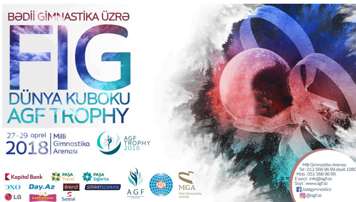
FIG RHYTHMIC GYMNASTICS WORLD CUP AGF TROPHY

WORK PLAN BAKU, AZERBAIJAN APRIL 27-29, 2018